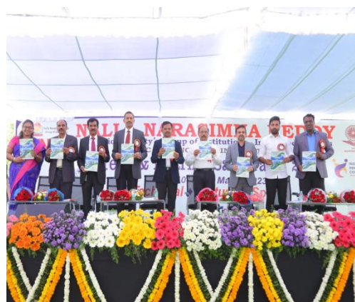
Release of college magazine 'Reflections'