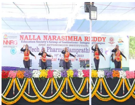
Welcome dance by students