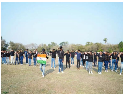
Flash mob as part of cultural activity