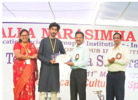
Valedictory programme 2K23