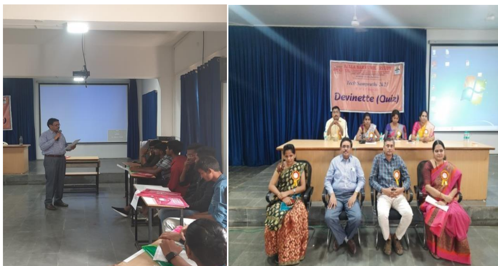
Final round of Devinette Quiz