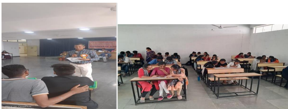
Screening test as part of the Quiz